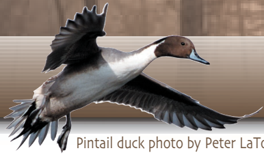
Pintail duck